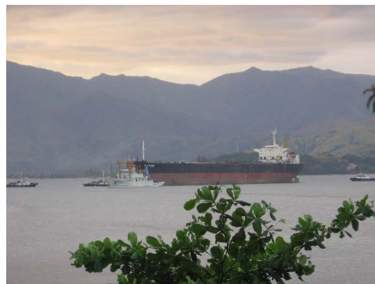
The Kudam leaving the Philippines at the start of its sea tow to Singapore

Fabrication of the mooring buoy and turret is underway in Singapore, the topside modules are being fabricated in Batam and the process vessels are being fabricated in Malaysia.