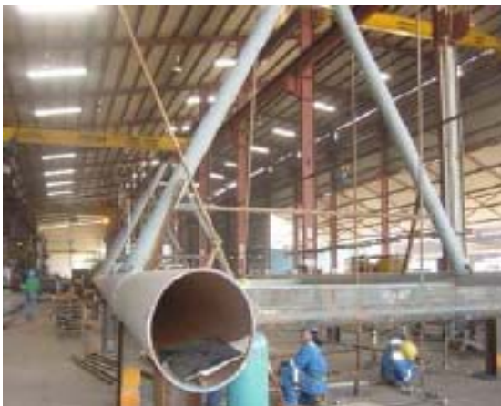
Fabrication of part of the FPSO flare tower