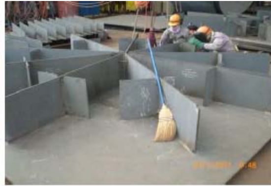
Part of the DTM buoy during fabrication

In late 2007, Prosafe (owner and builder of the Van Gogh FPSO), announced 'Ningaloo Vision' as the name of the FPSO. The name was chosen to reflect the development's geographic location 45 km north of the iconic Ningaloo Reef. The name and logo will feature prominently on the FPSO.