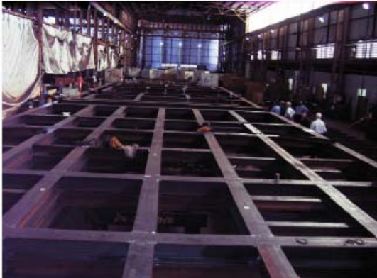
Subsea manifold framing fabrication at Ausclad, which is 50% complete